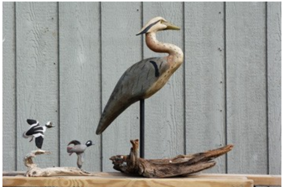
Miniature carving by Kefford Linton

More information at www.saxisislandmuseum.org or on Facebook at www.facebook.com/saxisislandmuseum